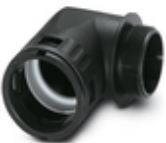
Cable gland, metric thread, IP68/69k protection, angled

Screw connection - WP-GA HF IP69K M40 BK - 3240915