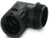
Cable gland, metric thread, IP66 protection, angled

Screw connection - WP-GA HF IP66 M40 BK - 3240929